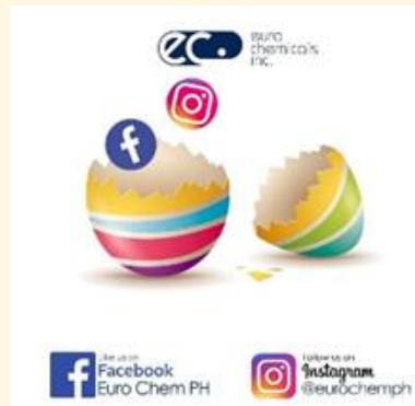
Social media account reveal poster sent to clients on April 12, 2020 Easter Sunday.

Your Corporate Social Media Team represented by key persons from Sales and Marketing Department worked day and night for the social media contents. We have our weekly #ECIP , read as “isip” are information posts and #EUROCAN , a wordplay of “You Can” are posts promoting our products. We also have some fun contents