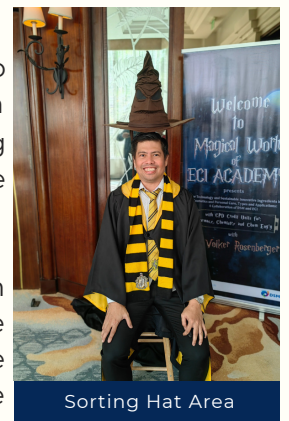
Sorting Hat Area

Entering the venue, another eye-catching feature would be the Instagram-worthy photobooth filled from top to bottom with a flurry of acceptance letters, owing to the iconic scene where Harry discovered that he was meant to go to Hogwarts and begin his life in the wizarding world. Entering the main hall, the audience is greeted by an impressive stage design, the ever-beautiful Hogwarts castle. At the back, the audience are