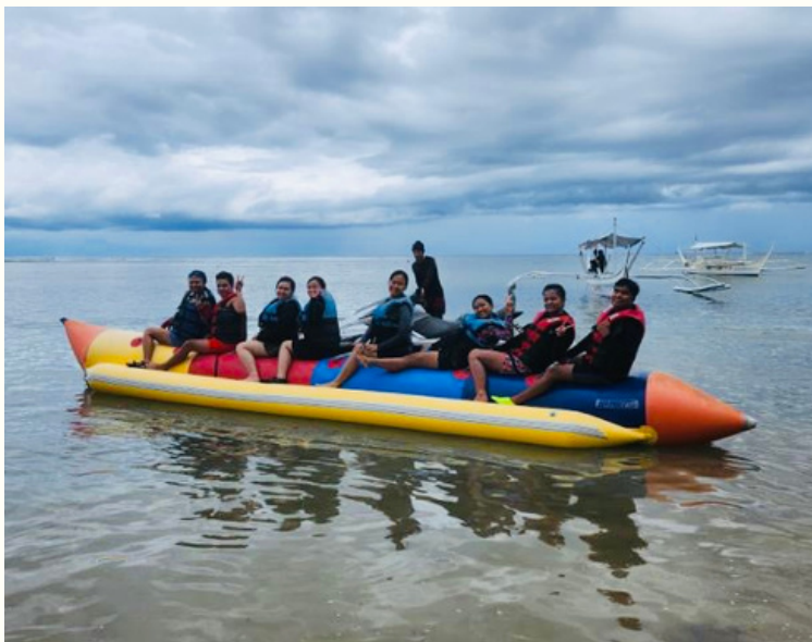
Thrill Seekers Unite: Experiencing the Ultimate Adventure with a Banana Boat Ride

During these moments, you could see and hear how our colleague's genuinely enjoyed each other's company. Having an event like this proves that even though we do a lot in our lives, we still need a little rest to refresh our brain away from work.