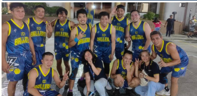
5th Placer: ECI Men's Basketball Team