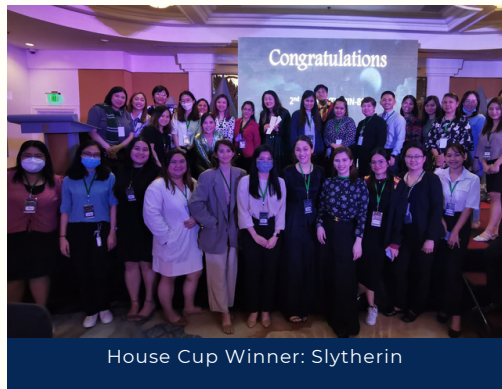
House Cup Winner: Slytherin