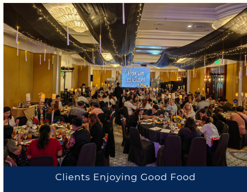
Clients Enjoying Good Food

And learning was made even more exciting since aside from the enchanting theme and energy of the place, and the warmth and skilled service of the Euro Chem team, there were game challenges to be won. The audience's competitive spirit was brought out in the energizer part of the program, as the mettle of mind and memory were tested in a wizarding world's version of the quiz bee. Simultaneously, a Quidditch challenge was announced, with everyone having the chance to be a Seeker, in hopes of finding a Golden Snitch and winning more points for the team.