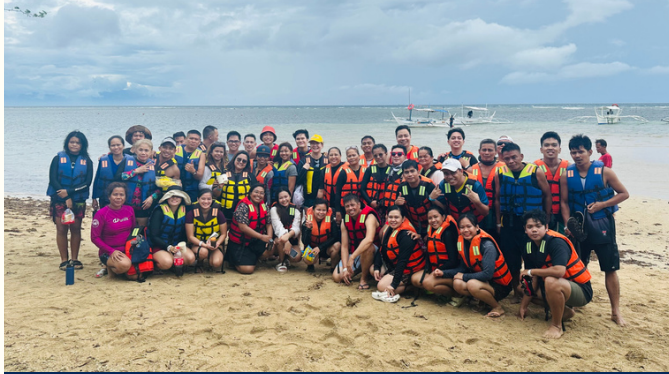
Mandatory company groupie

This year was a little different from last year where outing go with full programs planned. This year was about relaxation, quality time together in a relaxed environment and unwinding at a beautiful location. For this year, the venue