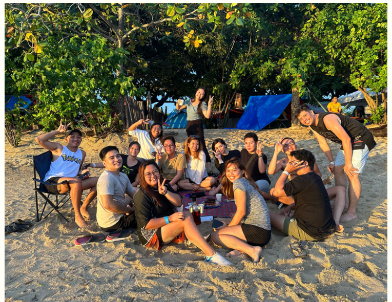
Sun, Sand, and Card Games: Unwinding with Group Card Play at the Beach