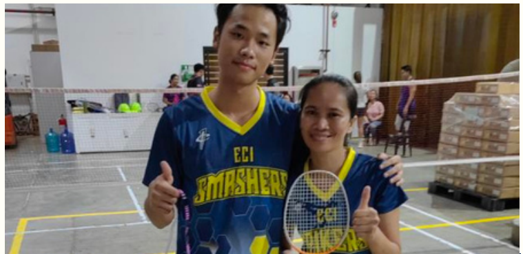
Champion: ECI Badminton Duo