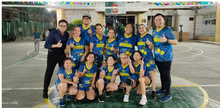
Champion: ECI Women's Volleyball Team