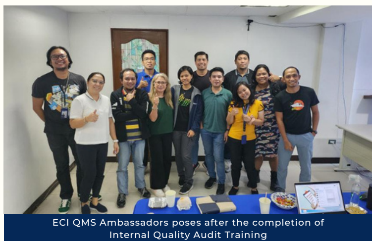
ECI QMS Ambassadors poses after the completion of Internal Quality Audit Training