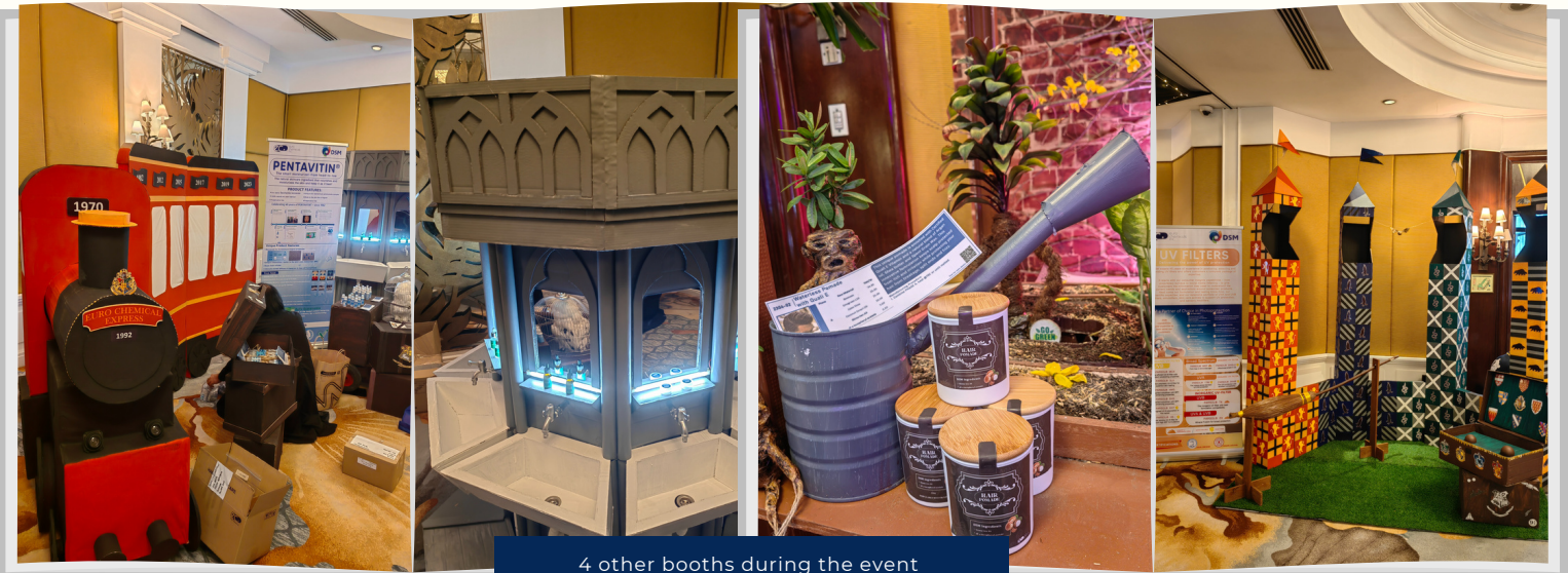
4 other booths during the event

Wrapping up the event, the day ended with a festive celebration with our clientele, which certainly was a magical moment for many, enjoying good food, good wine, good music, and good company. Truly, this event brought out the best qualities in many of the Euro Chem team, and would surely be a bright milestone in the company's journey to come back strong after the dark years of the pandemic. With love and dedication always, anything is possible.